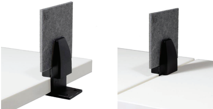
T-Mount: Fixes to the underside of 2 worktops