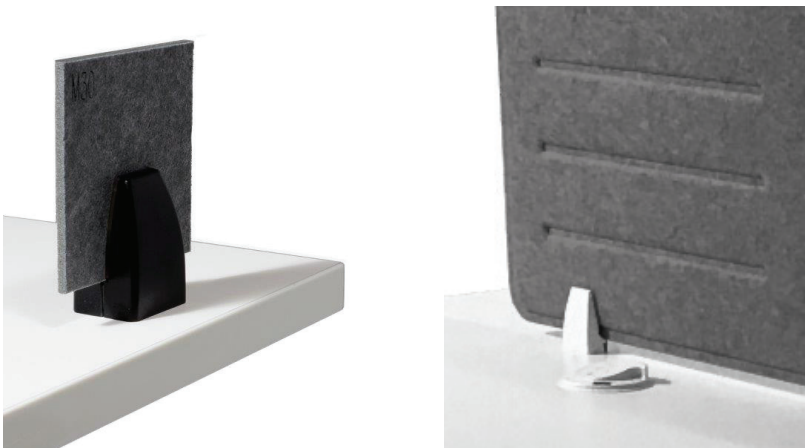
F-Mount: Fixes directly to the worktop face