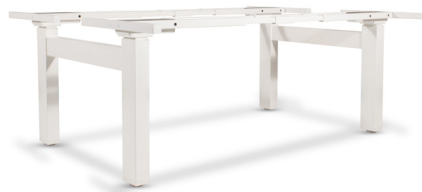
Back to back