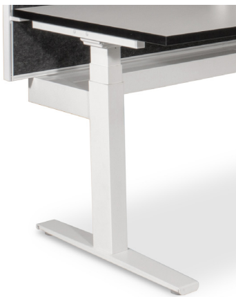
Single workstation with screen and cable tray