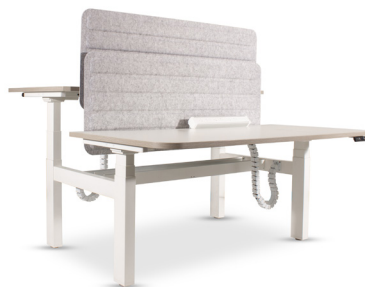
Back to back workstation with PET panels